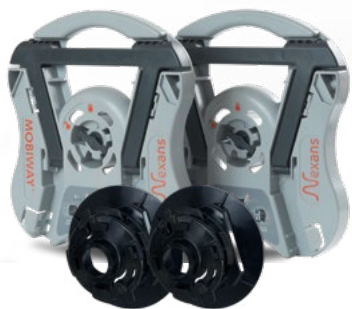
Set of MOBIIWAY™ Flanges & Adaptors

A newly patented, unique reel transport and unwinding system.