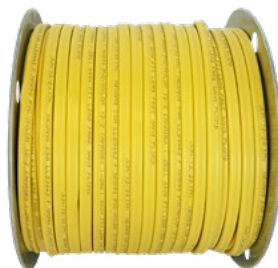
Nexans Reel & Cable