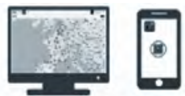
SAAS (Service As A Solution) platform accessible 24/7 on internet or mobile app to check location and lengths, but also cable information, site contacts, and project reference etc..