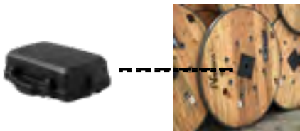
Devices embedded in our reels