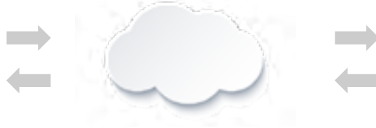
CLOUD NATIVE 2G/3G/4G or 5G networks